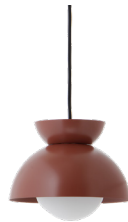
Item No. 125256 MATT RED