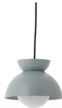
Item No. 125254 MATT PALE GREEN