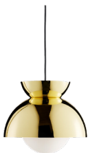
Item No. 134877 BRASS