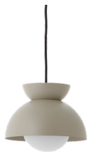
Item No. 125255 MATT TAN GREY