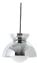
Item No. 127031 CHROME