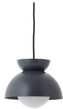
Item No. 125258 MATT STEEL BLUE